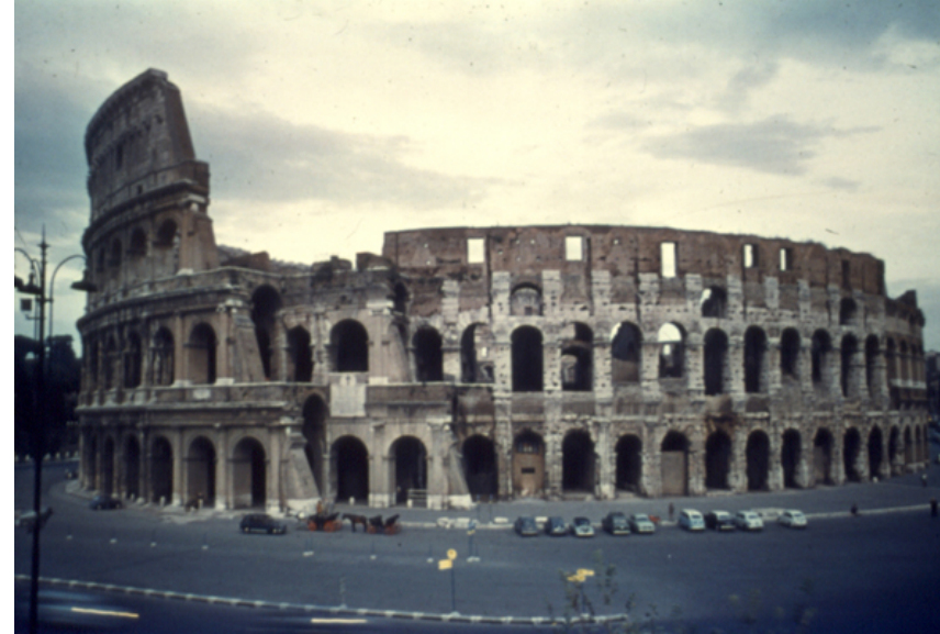
Fall of Rome (410) / Roman Colosseum

“In 250 the new emperor Decius (249-51) ordered a systematic persecution, requiring that everyone should possess a certificate that he had sacrificed to the gods [of Rome] ... the number of apostates was immense ... .”