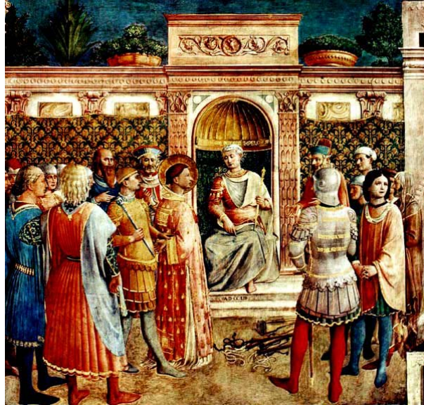
Trial of Justin Martyr (165)