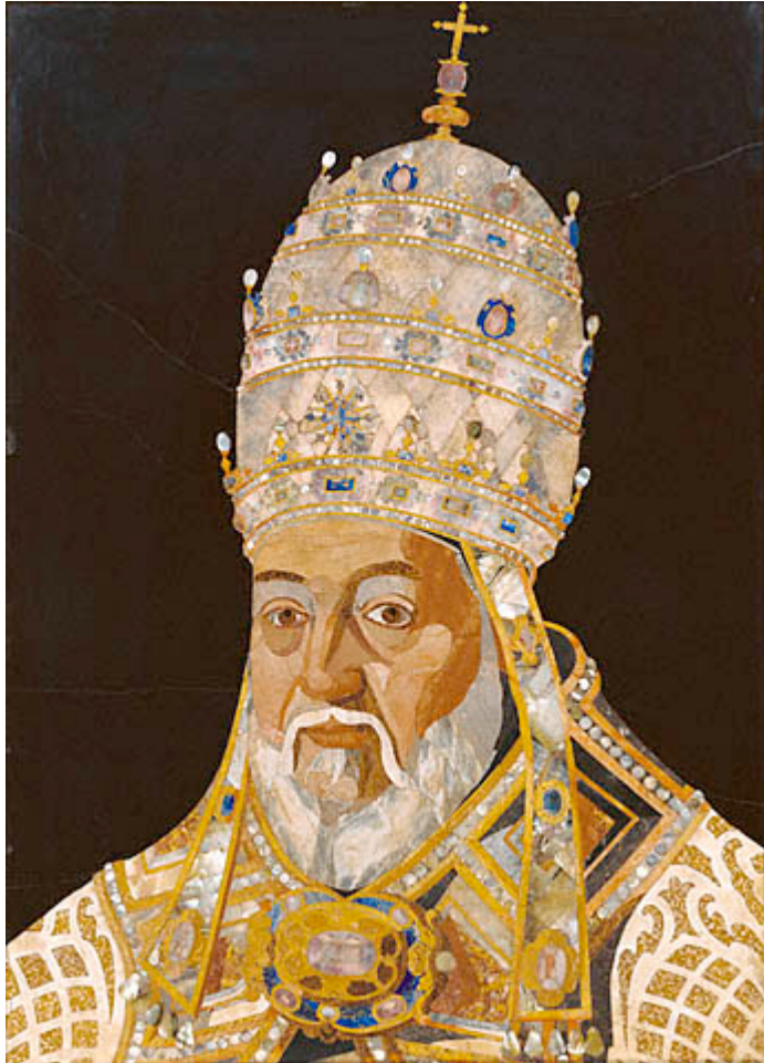
Mosaic depicting Pope Clement VIII (1592) wearing a tiara with three crowns