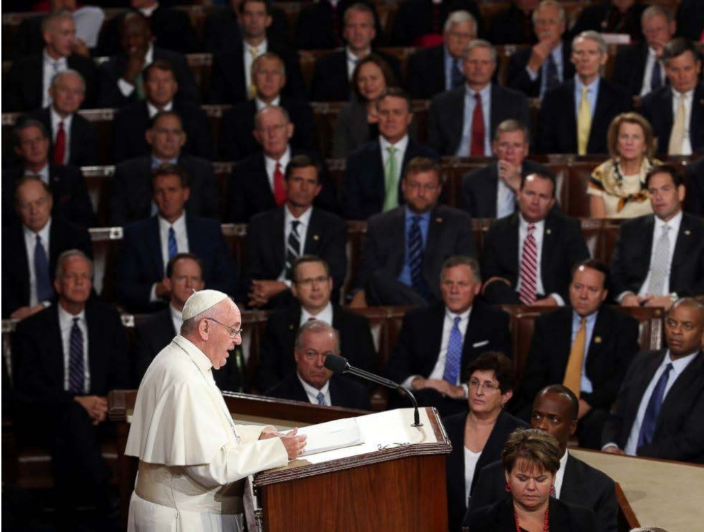
Pope Francis address the US Congress (September 24, 2015)