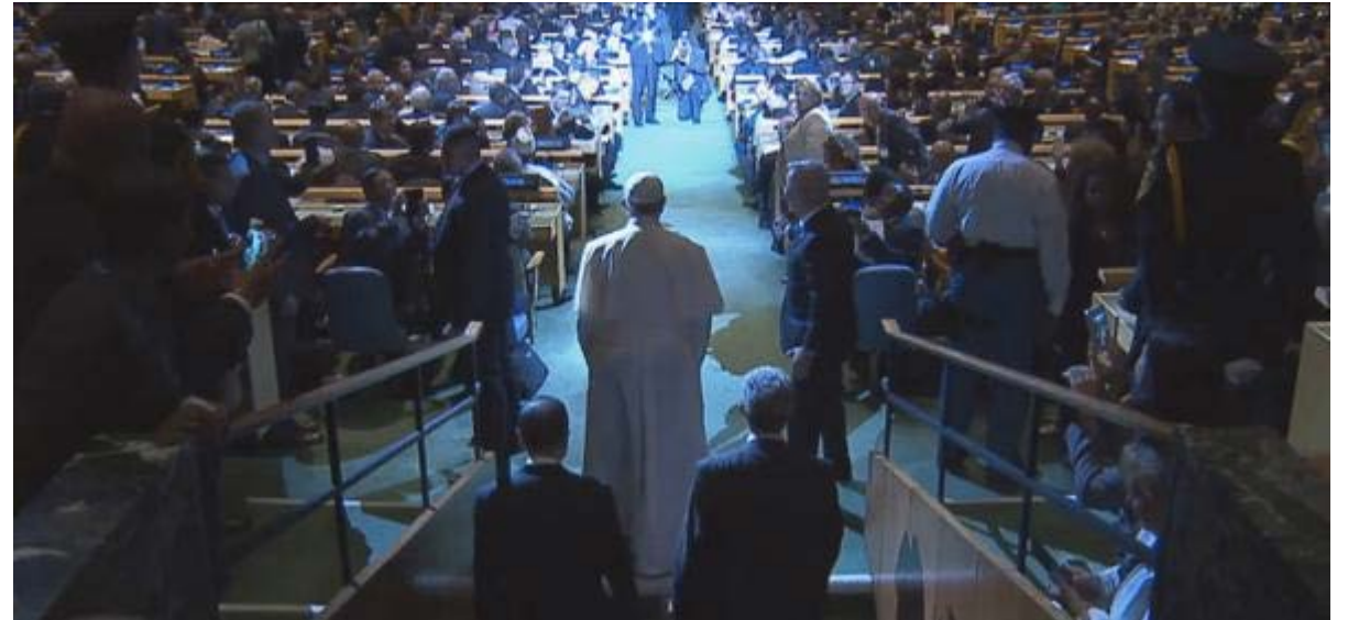
Pope Francis addresses the “largest gathering of presidents and prime ministers ever at the United Nations,” according to the New York Times. (September 25, 2015)